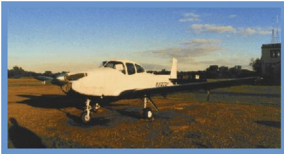
Fig. 1: The Navion flight model is one of the features FlightGear inherited from LaRCsim. Until now it is the only one plane being fully realized in FlightGear.

It was Curt Olson from the University of Minnesota (curt@flightgear.org) who re-started the project in the middle of 1997. His idea was as simple as successful: Why invent the wheel a second time? There have been several free flight simulators available running on workstations under different flavors of UNIX. One of these, LaRCsim, having been developed by Bruce Jackson from NASA (jackson@larc.nasa.gov) seemed to be well-adapted for the present approach. Curt took this one apart and re-wrote several of the routines in a way making them buildable as well as run-able on the intended target platforms. The key idea in doing so was selecting a system-independent graphics platform, i. e. OpenGL, for the basic graphics routines.